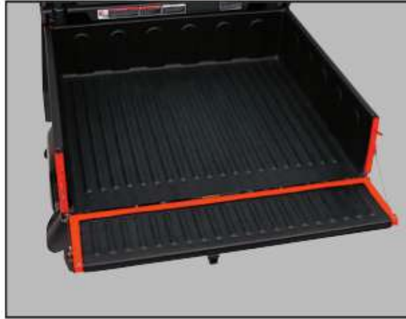
■ Plastic Cargo Bedliner