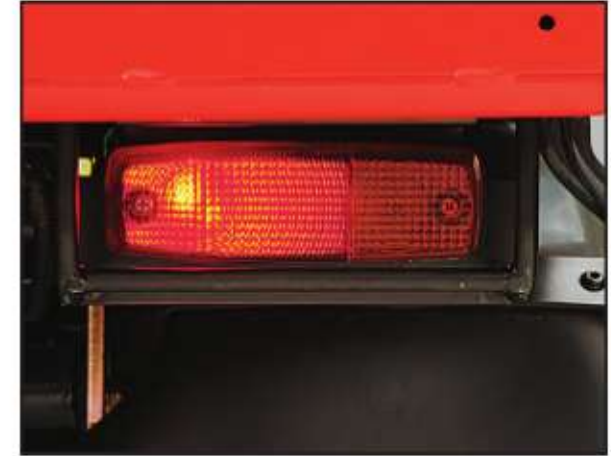
■ Tail Lamp Guard