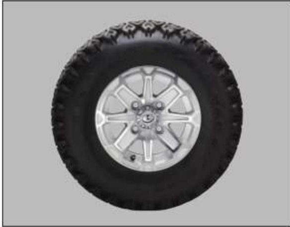
■ Alloy Wheels